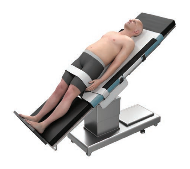
Reverse Tredelenburg Positioning